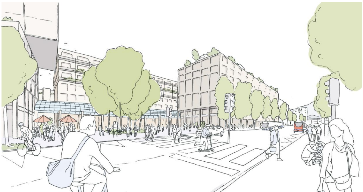
New Metalli Square as a starting point and gateway as well as an ideal, logical link to the railway station.